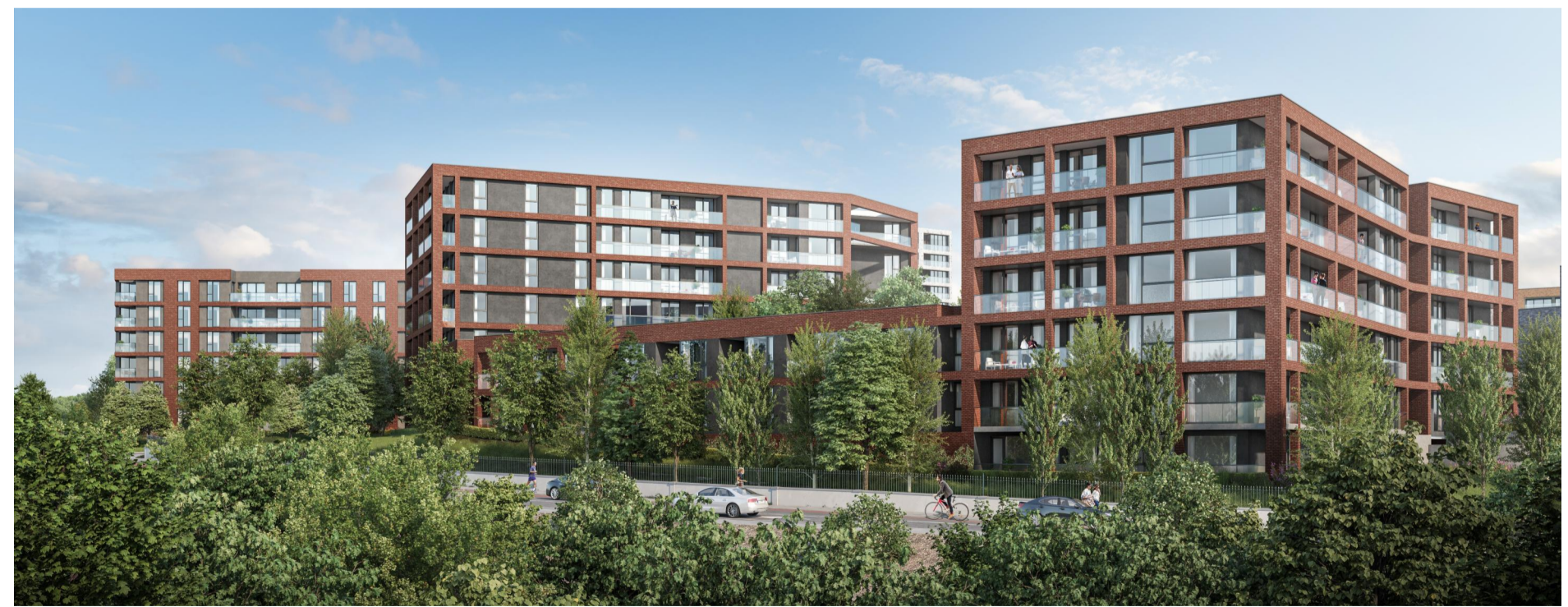
3D VIEW FROM MARKIEVICZ PARK TO BLOCK C