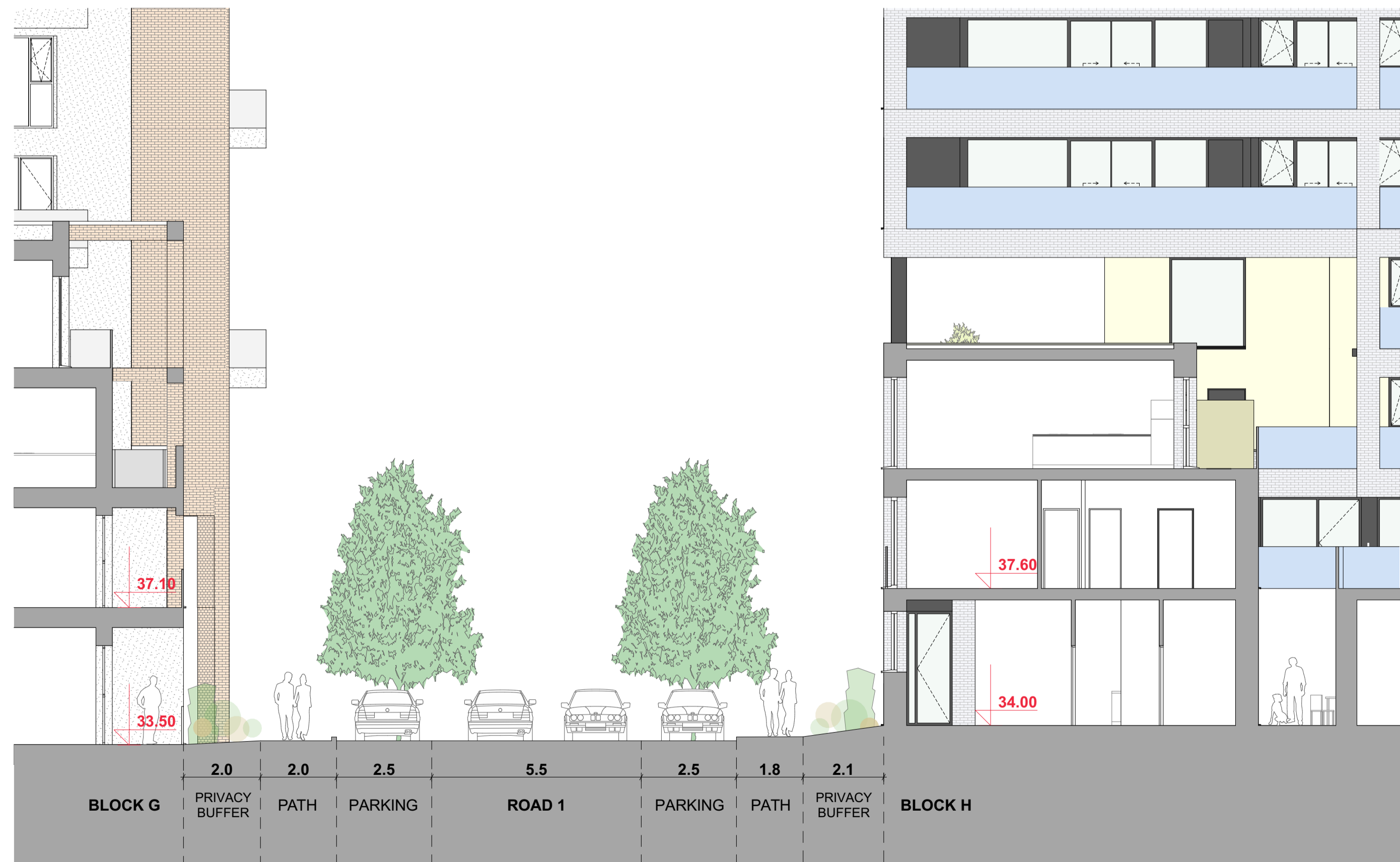
BOUNDARY CONDITION SECTION S08 - BLOCK G / BLOCK H 1:100