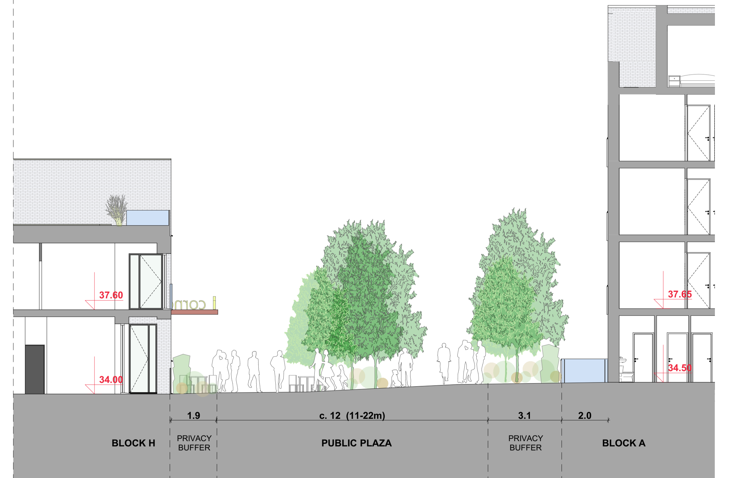
BOUNDARY CONDITION SECTION S09 - BLOCK H / BLOCK A 1:100