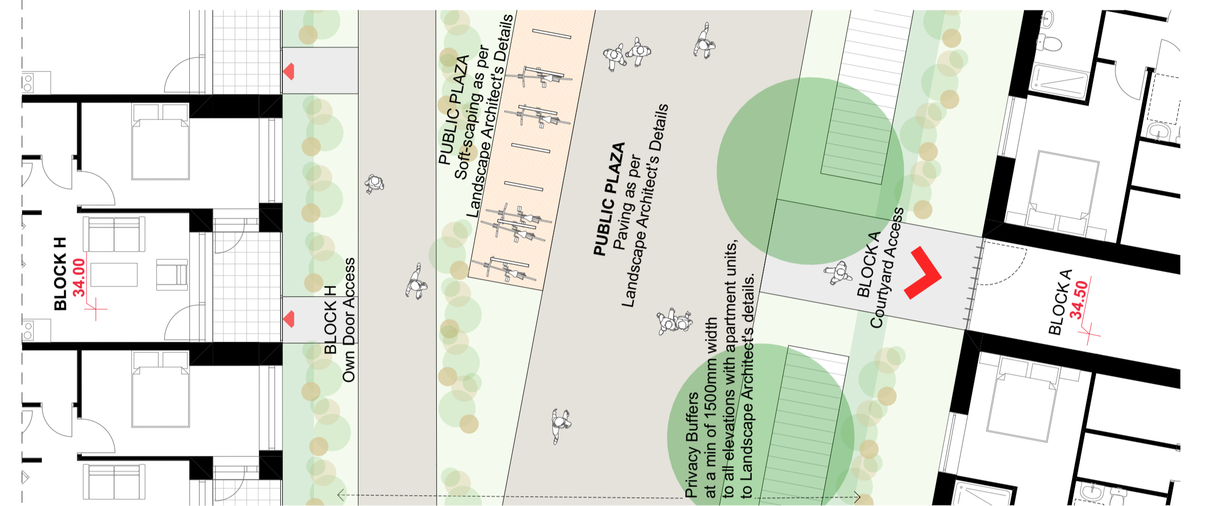
BOUNDARY CONDITION PLAN S09 - BLOCK H / BLOCK A @ GROUND FLOOR LEVEL 1:100