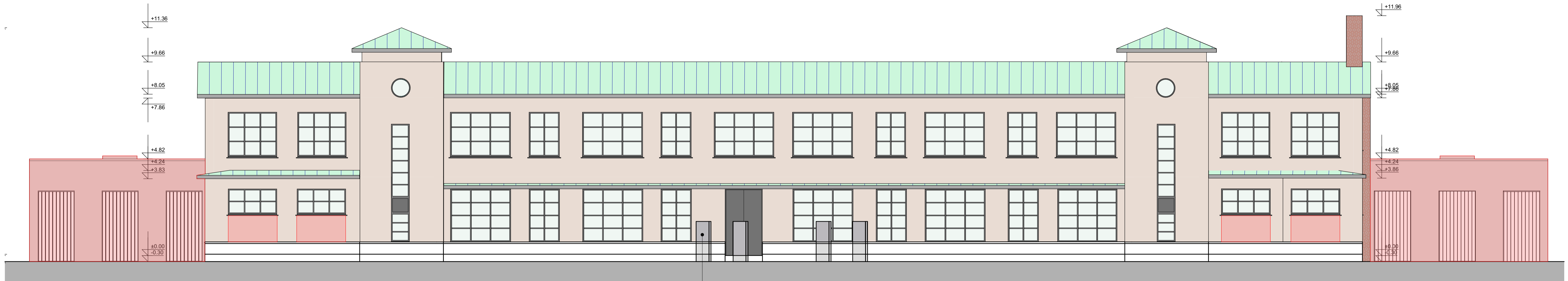
South Front Elevation - Demolition 1:100