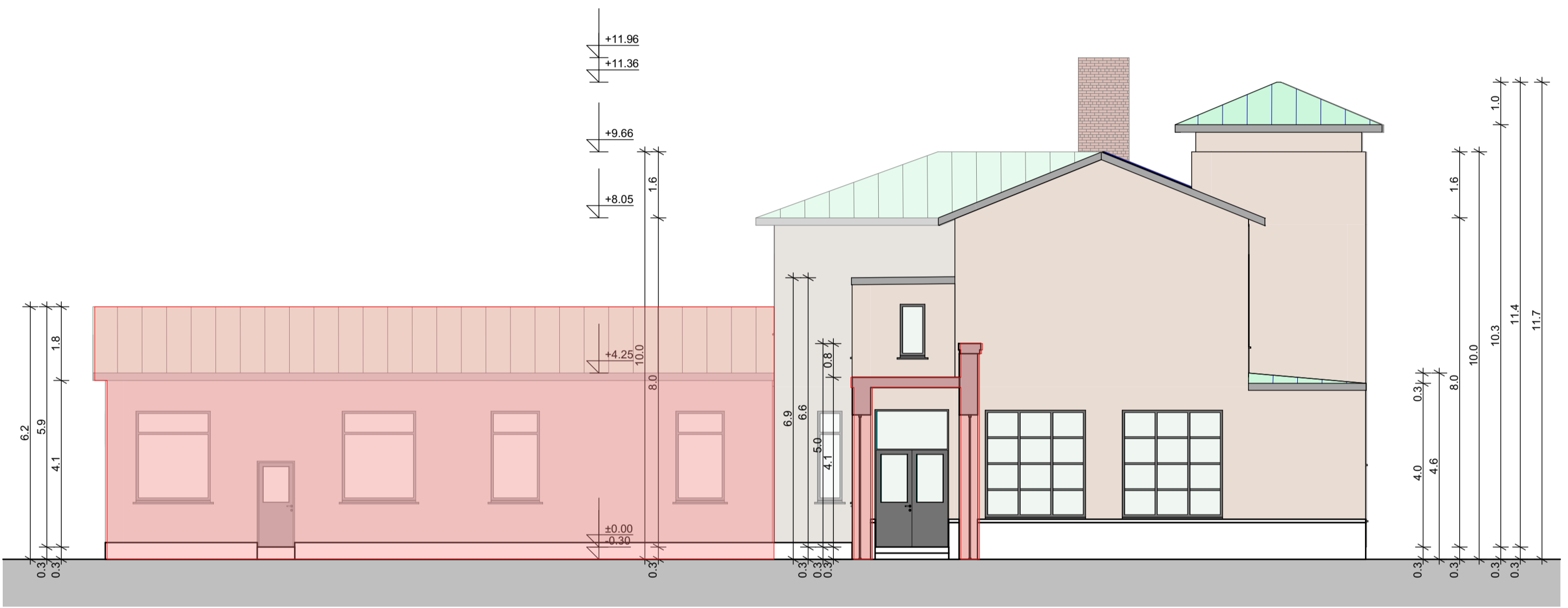
West Elevation - Demolition 1:100