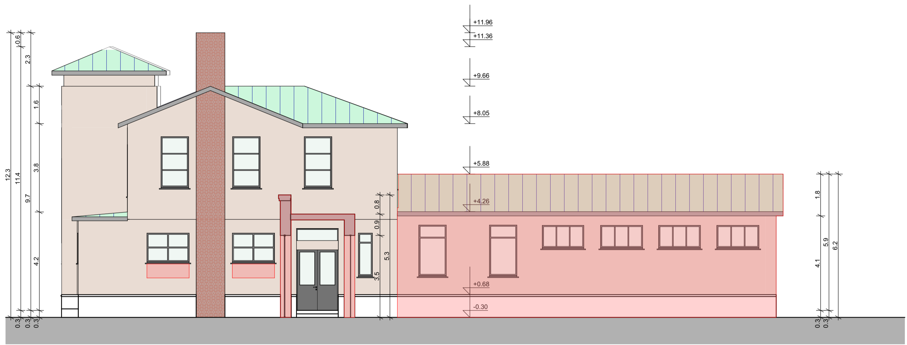
East Elevation - Demolition 1:100