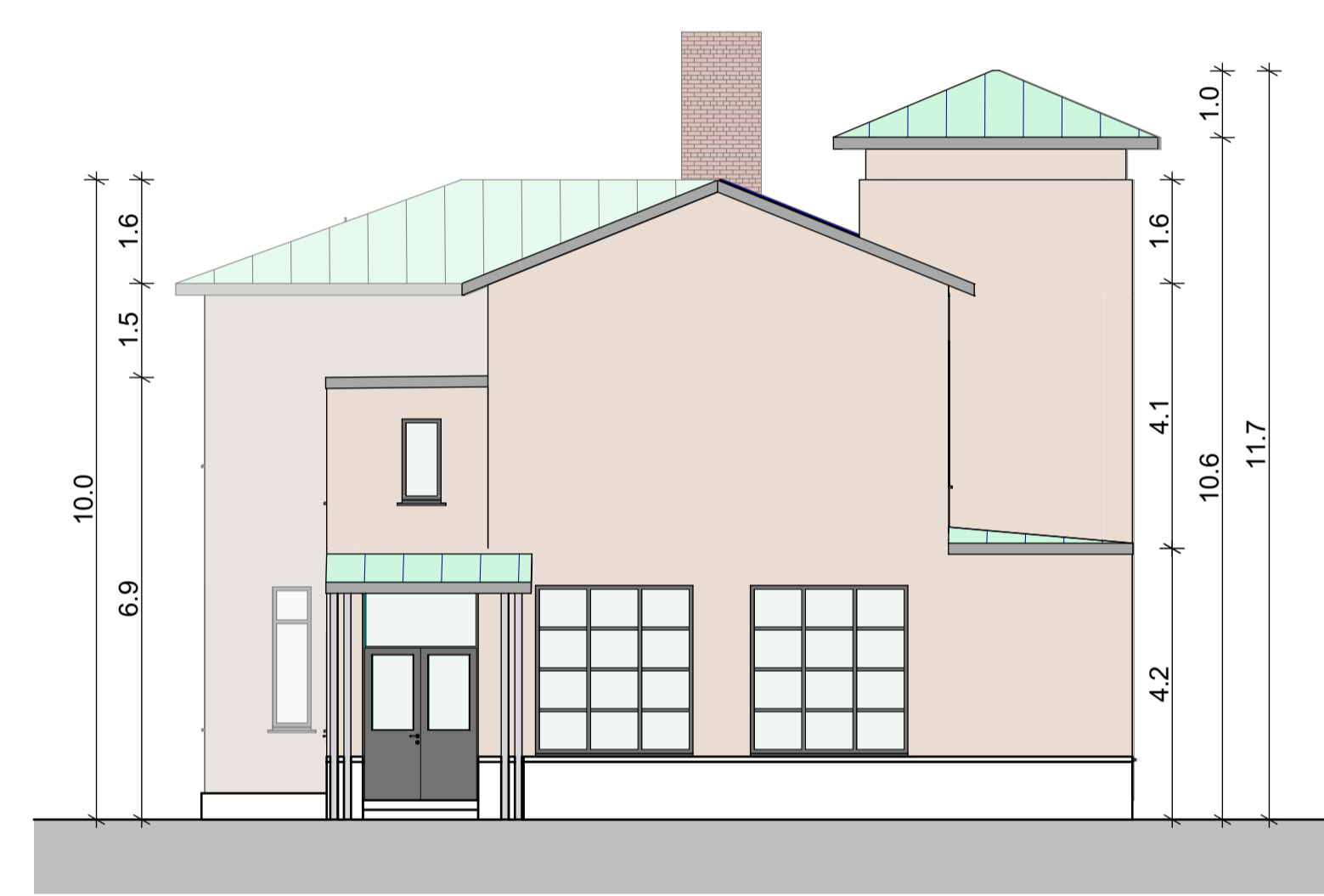
West Elevation - Proposed 1:100