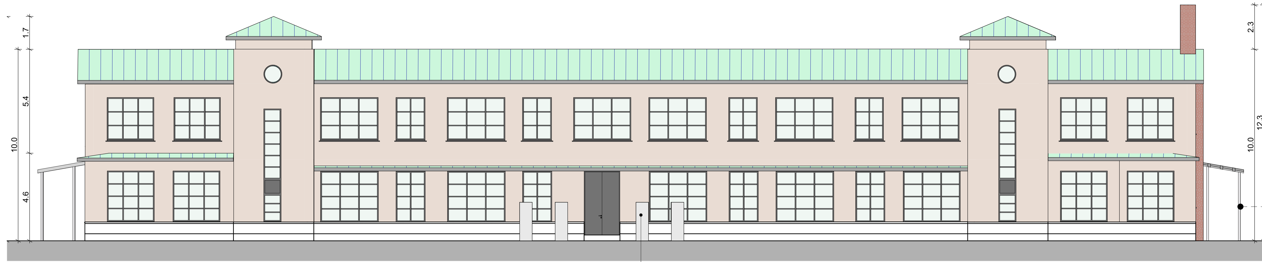
South Front Elevation - Proposed 1:100

Proposed Location of the existing Gate Posts