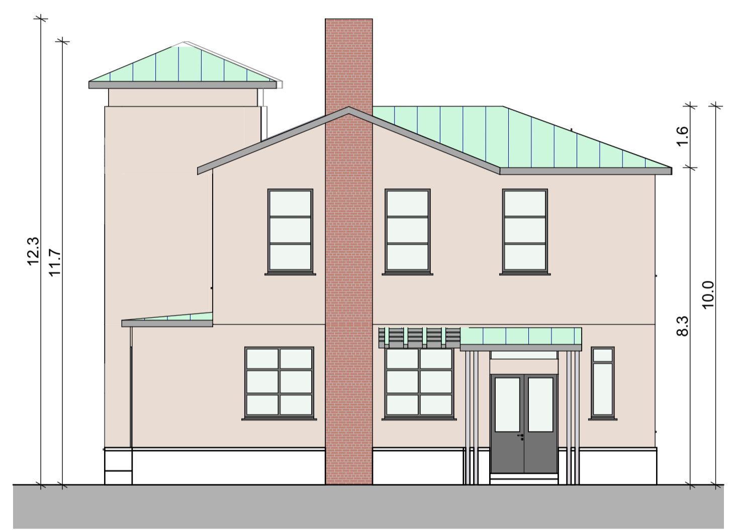
East Elevation - Proposed 1:100

Proposed Location of the existing Gate Posts